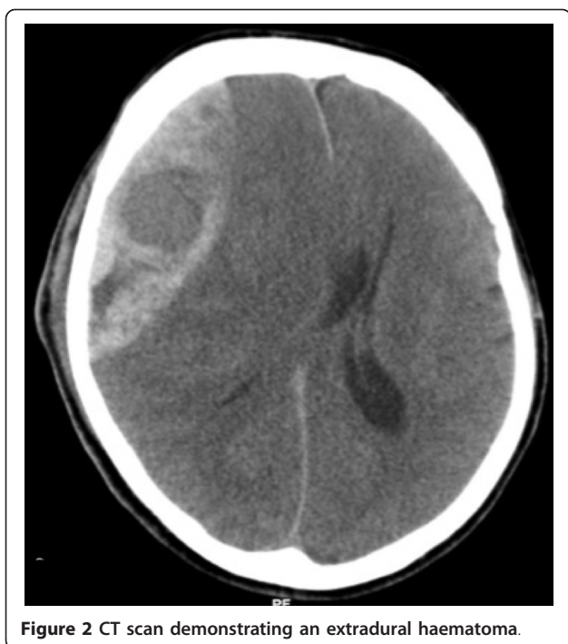
Figure 2 CT scan demonstrating an extradural haematoma.